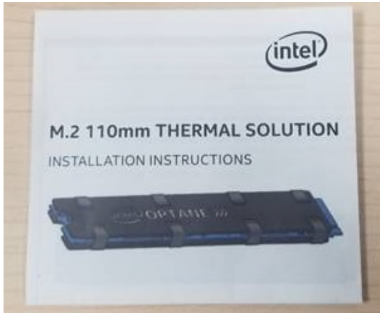
Thermal solution installation instructions