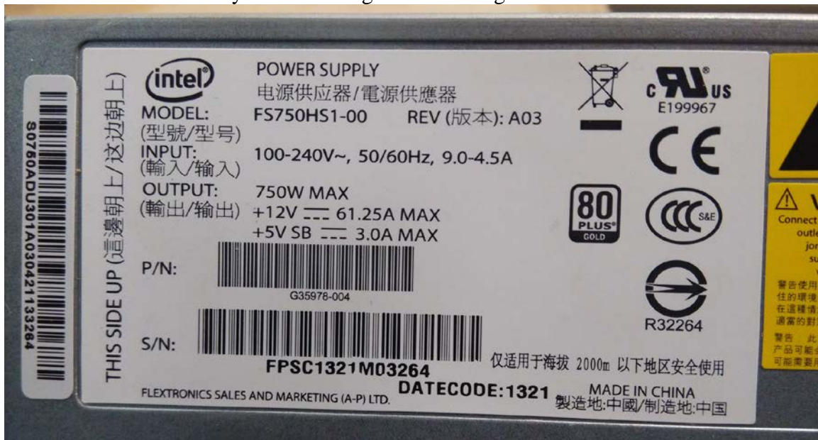
Figure-1a: Pre-Change (G35978-004)