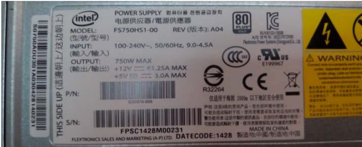
Figure-1b: Post Change (G35978-005)

2. Increase the two capacitor values of C11 and C13 on the Spare Power Distribution Board (PDB) FBP750PDB from 0.1 \mu F to 2.2 \mu F to extend the duration of the Over Current Protection (OCP) circuit from 0.6ms to 8.0ms. This change prevents the potential system shutdown event triggered by the violation of the 240VA regulation of the OCP circuit. See Figure-2 below.