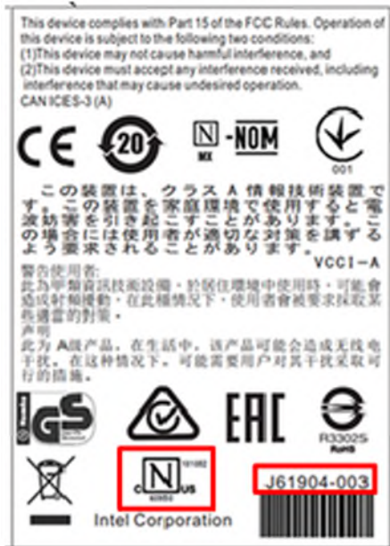
Figure 3. Chassis Label - Before