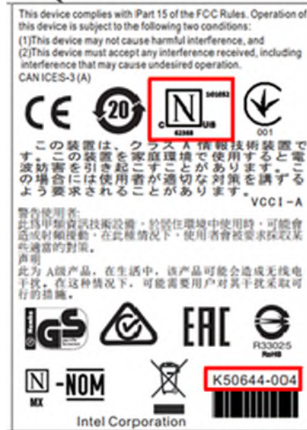
Figure 4. Chassis Label - After