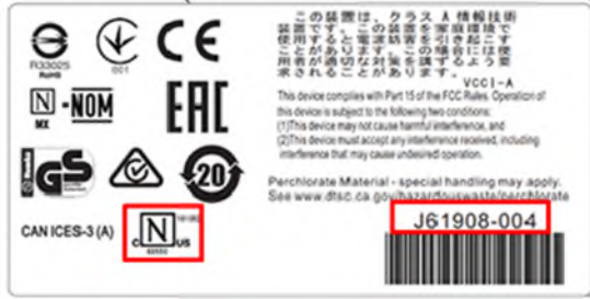
Figure 5. Outer Package Label - Before