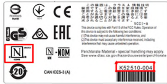
Figure 6. Outer Package Label - After