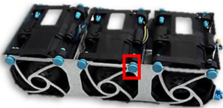
Figure 1: Fan holding Grommet previous changes (color is blue)

Intel® is changing the color on the Fan holding Grommet J76819 (See below images) on the Intel® Server Systems listed in the products affected table.