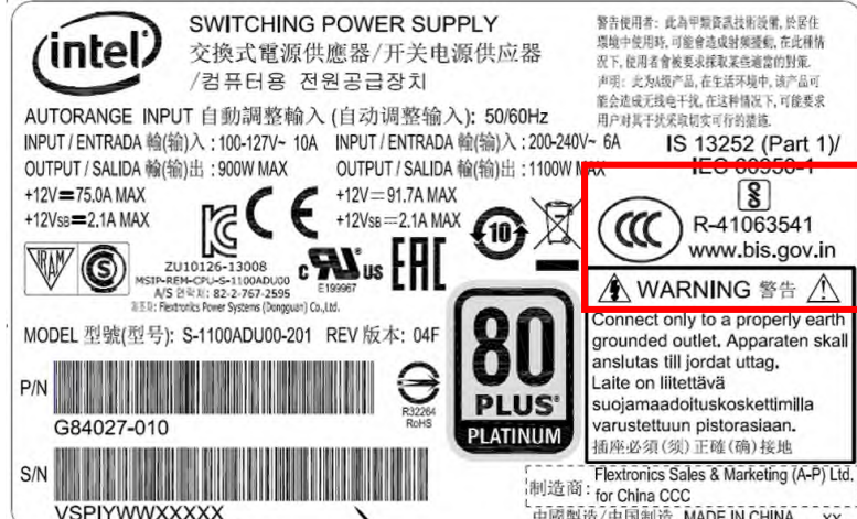
Image 2. Power supply label after change