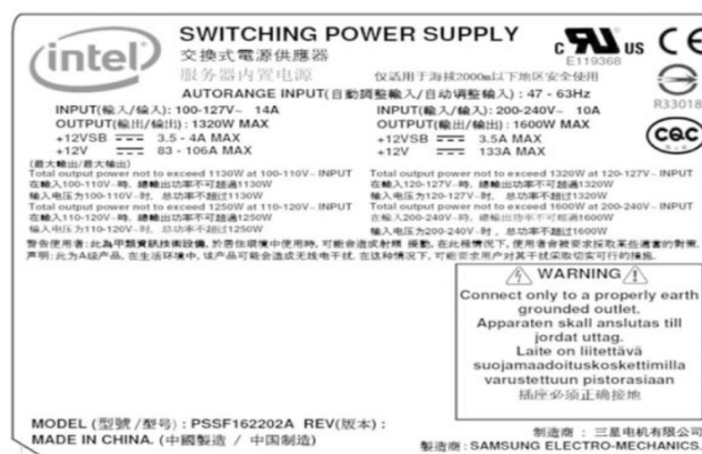
Figure 1. Before Change