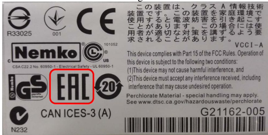
Post change label