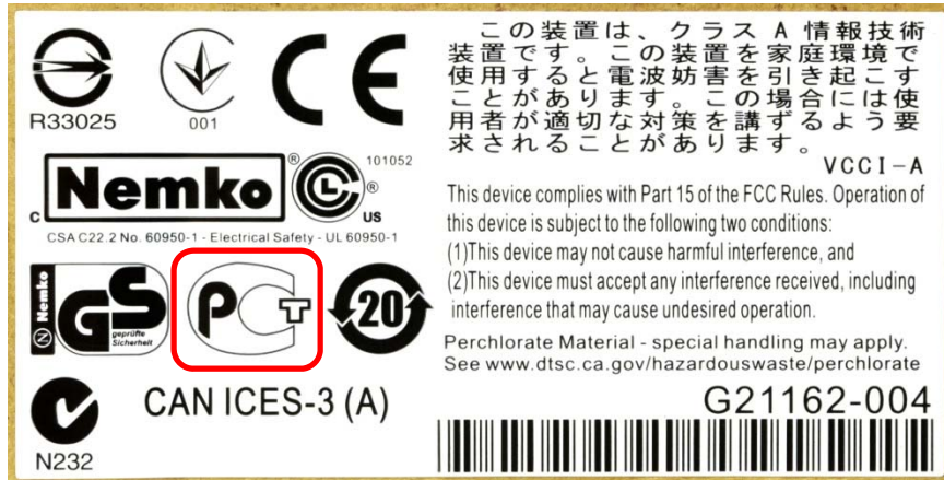
Pre change label