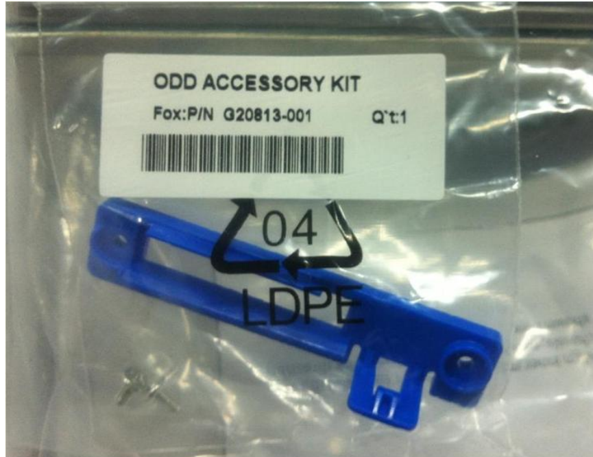
Figure-2: ODD Accessory Kit

2. Add an ODD accessory kit. See Figure-2 as below: