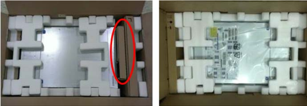
Figure 2. Packaging changes for 2U chassis and systems