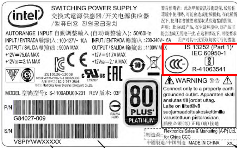
Image 2. Power supply label after change