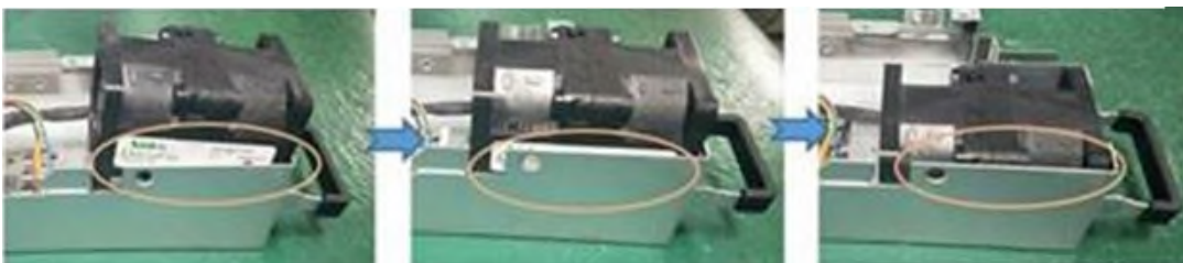
Figure 3. Label is now covered and protected by power supply chassis