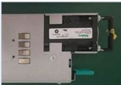
Figure 1. Previous Label Location