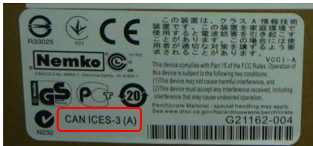
Figure-4: Safety Label