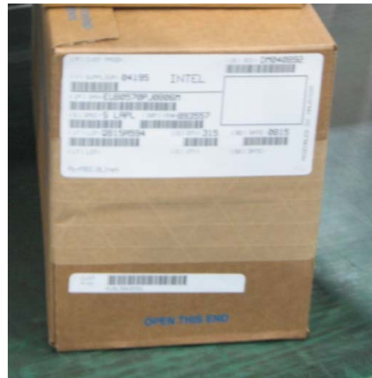
CPN on Small Label below Box Label - Tray - New

The customer part number (CPN) on the small label will be placed next to the box label on tape and reel packed products. A reel label with the customer part number will be attached to the desiccant bag for the customer to peel and place on the reel. See example below.