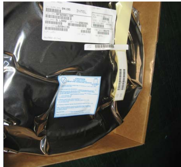
CPN on Small Label under Box Label with Reel Label Attached