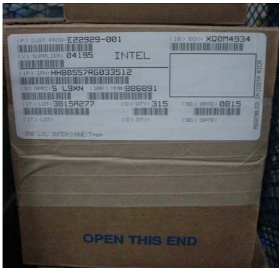
Customer Part Number on Box Label - Current

In order to reduce the time it takes to relabel the box if a customer part number is required, we are changing the process by using a smaller label. It will be placed below the original label on tray packed products. See example below: