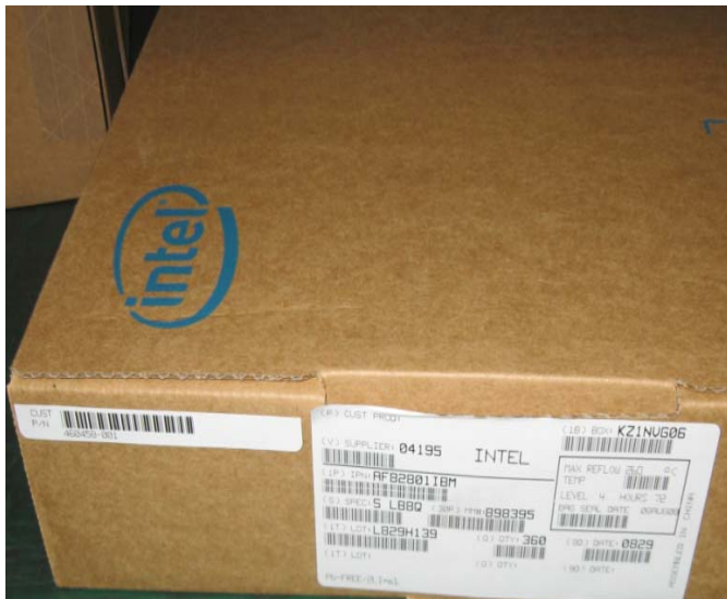
CPN on Small Label next to Box Label on Reel Box - New