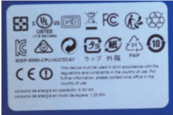
Current pretty box label on BOXNUC6CAYSAJ