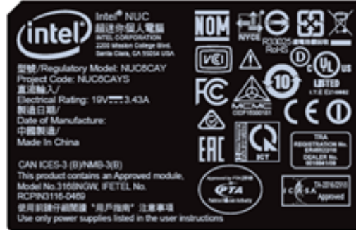
Updated pretty box label, add ISACA logo