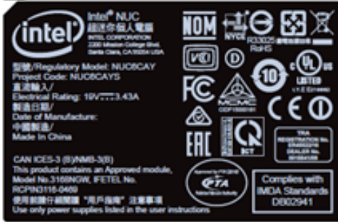
Current pretty box label on BOXNUC6CAYSAJ