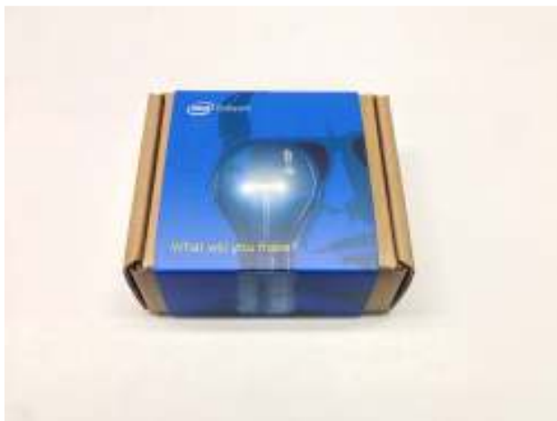
Figure-1: Pre-Change (Front) Length 106", Width 87", Height 40"