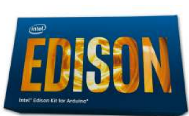
Figure-2: Post-change (Front) Length 79", Width 32", Height 135"