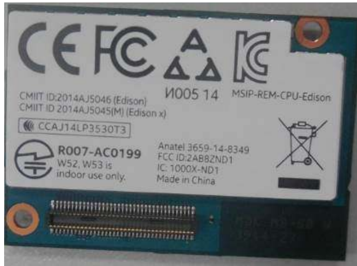
Current – Shield w/ printed label on top (sticker)