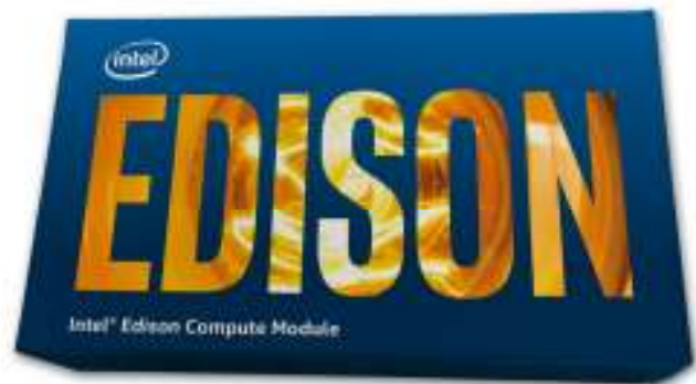
Figure-2: Post-Change (Front) Length 79", Width 32", Height 135"