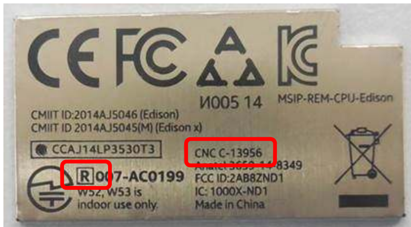
New – Print on the shield directly (no sticker)