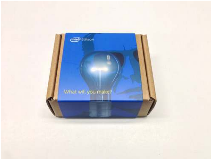
Figure-1: Pre-Change (Front) Length 106", Width 87", Height 40"

EDI2BB.AL.K Edison: Standard Power on board antenna + Mini-Breakout EDI3BB.AL.K Edison: Standard Power on board antenna + Mini-Breakout