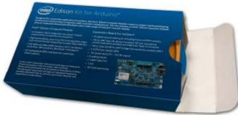
Figure-3: Post-change (Back) Length 79", Width 32", Height 135"