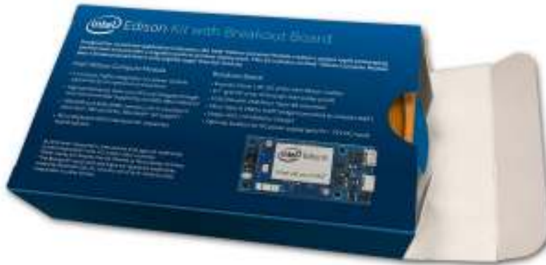
Figure-3: Post-change (Back) Length 79", Width 32", Height 135"