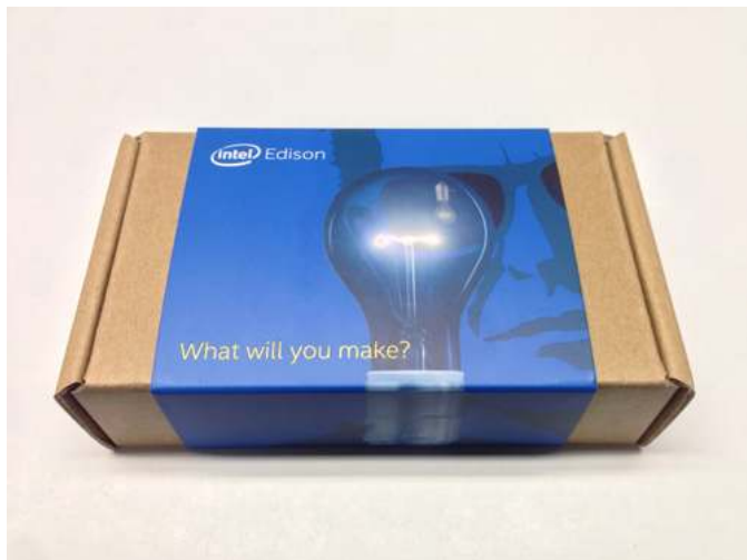
Figure-1: Pre-Change (Front) Length 156", Width 87", Height 40"

EDI3ARDUIN.AL.K Edison: Standard Power on board antenna + Arduino